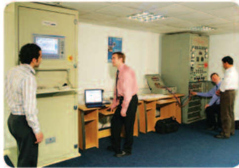
Training services can either be delivered at our facilities in the UK or at the customers premises.