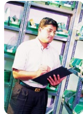
Materials control management systems